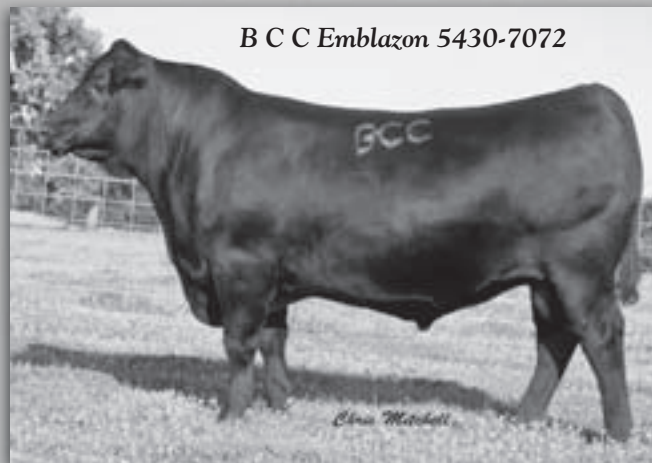
45 paternal brothers to this "average" priced bull from our 2008 sale sell!

If you're buying Angus or Charolais bulls, let us show you how our genetics can make you more profitable and your life less stressful. We sell affordable bulls bred with cow sense – but more importantly with common sense!