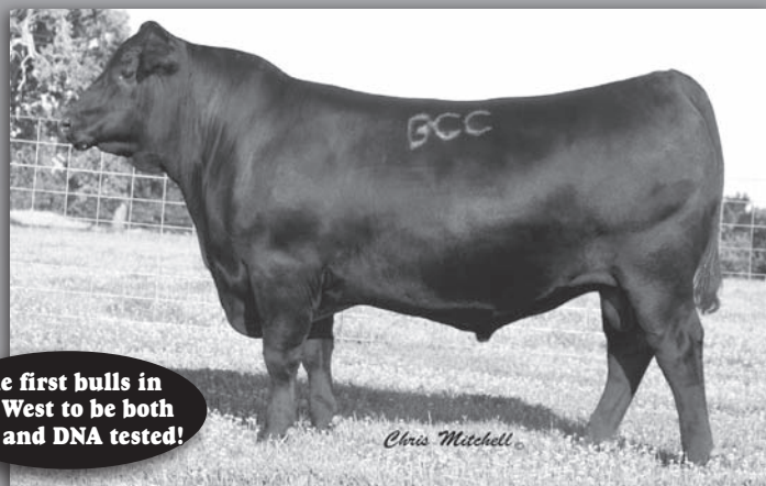
The first bulls in the West to be both RFI and DNA tested!

Plan to attend our "cattlemen's seminar" before the sale and learn about RFI, DNA testing and marketing opportunities from the most influential people in the industry today!